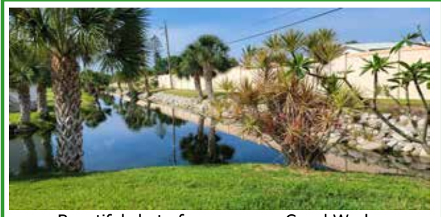
Beautiful shot of progress on Canal Work.