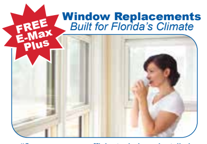
"Our new energy efficient windows installed by AMS are beautiful. Everything from start to finish was great."