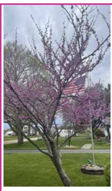
Ahhh, the Redbuds! Spring Arrived in Michigan!