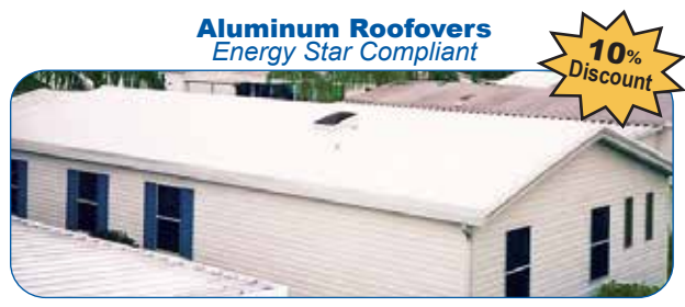
"This is simply the best roof over system available. We love our new roof. Thanks you and your staff."