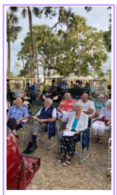
Nice crowd for the Easter morning Sing-a-Long.