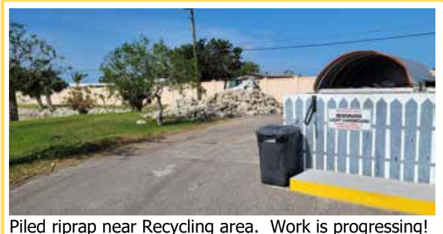
Piled riprap near Recycling area. Work is progressing!